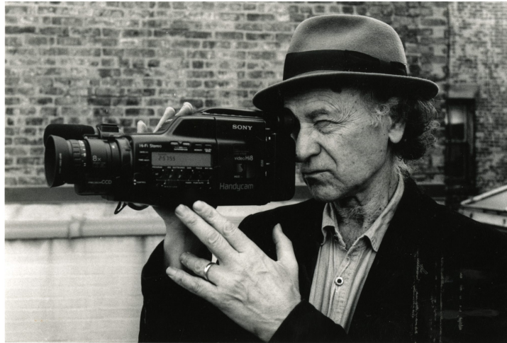
Jonas Mekas in Fragments of Paradise.